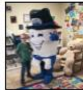
[Above: Storytime 2/22 with Vista Dental and Toby Tooth]